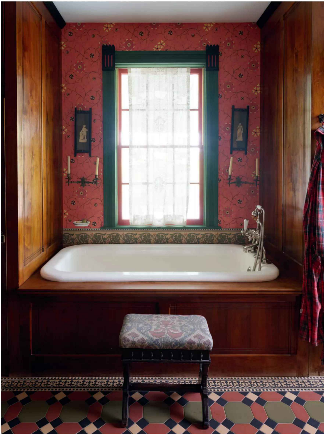
Above: one of the bathrooms features a tub that architect Calvert Vaux installed in the 1850s at Beaulieu, Lilla's family home in Newport, Rhode Island. Opposite: a Philadelphia canopy bed lords it over the main bedroom, along with George Washington in an engraving