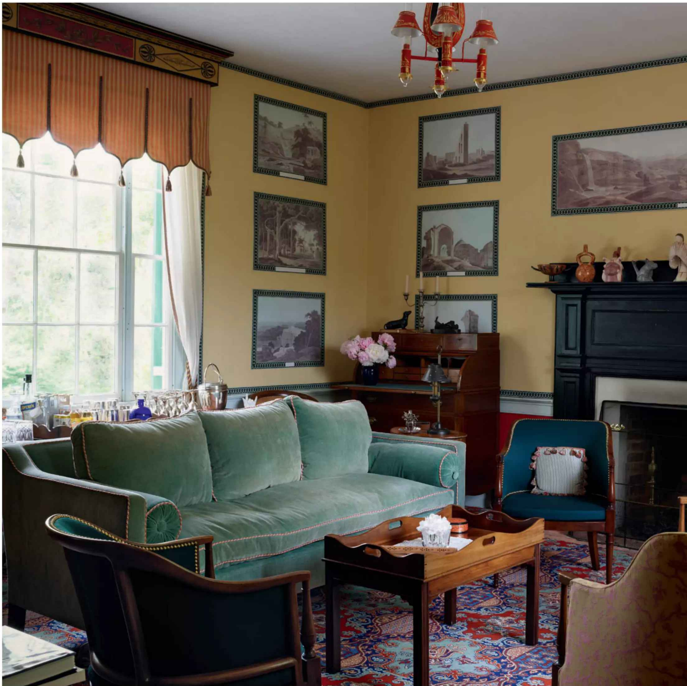
Above: an exercise in 'period-style decorating as opposed to a museum interior', the parlour features chairs made for the Massachusetts State House and, on the mantel, souvenirs from the owner's travels for the World Monuments Fund. Opposite: over a family-room door hangs a New York landscape, early 1800s, by Thomas Chambers. Beyond, the kitchen's pendants are from Stiffkey Bathrooms